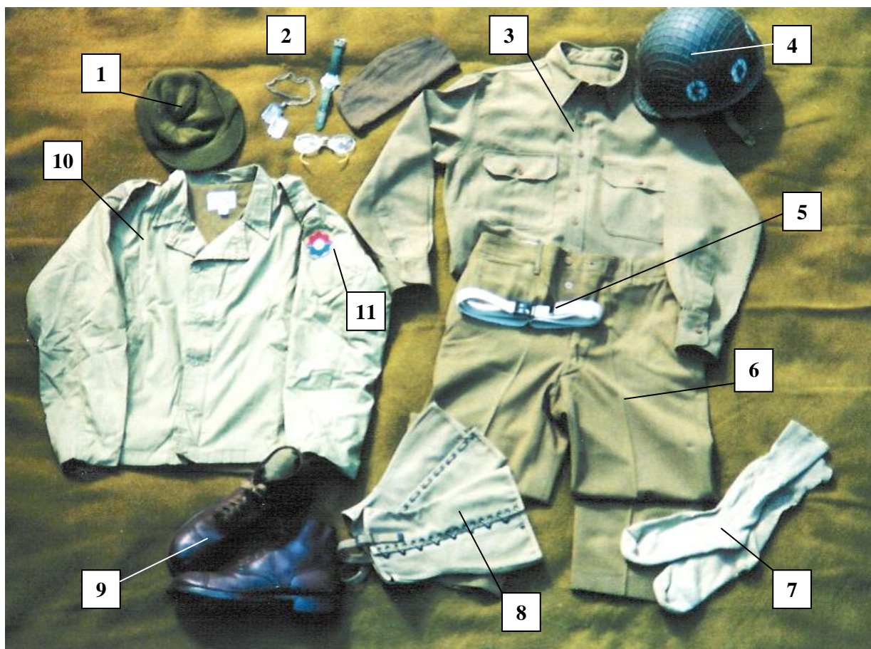
Displayed on WWII G.I. Blanket